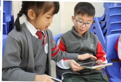
Woah! You are so fast!