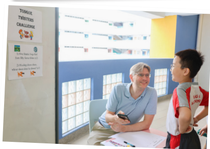
How fast can you get?