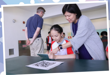
Pay attention to the clue here.