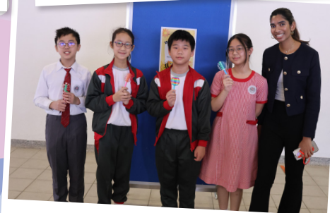
We are the winners of the Spelling Challenge!