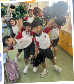
Practising our next chant!