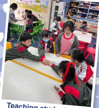
Teaching students how to play card games.