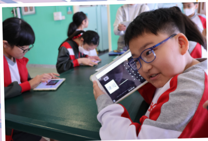
Which word is it?