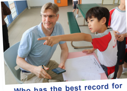
Who has the best record for the Tongue Twister Challenge?