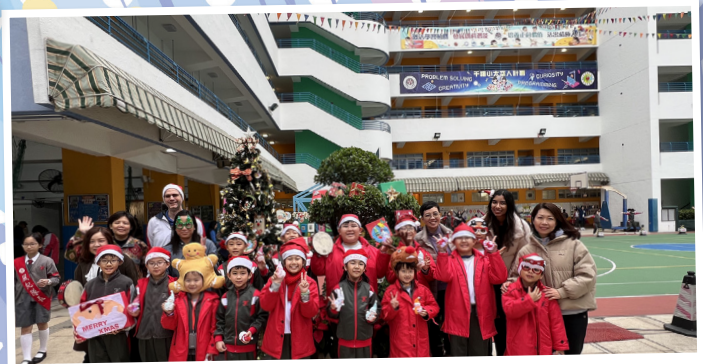
Sending Christmas greetings to you all!